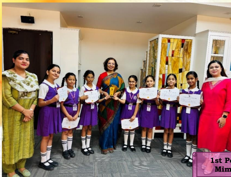
1st Position Mime Act

Applause to the champions - your brilliance shines bright!