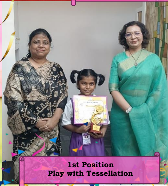
1st Position Play with Tessellation