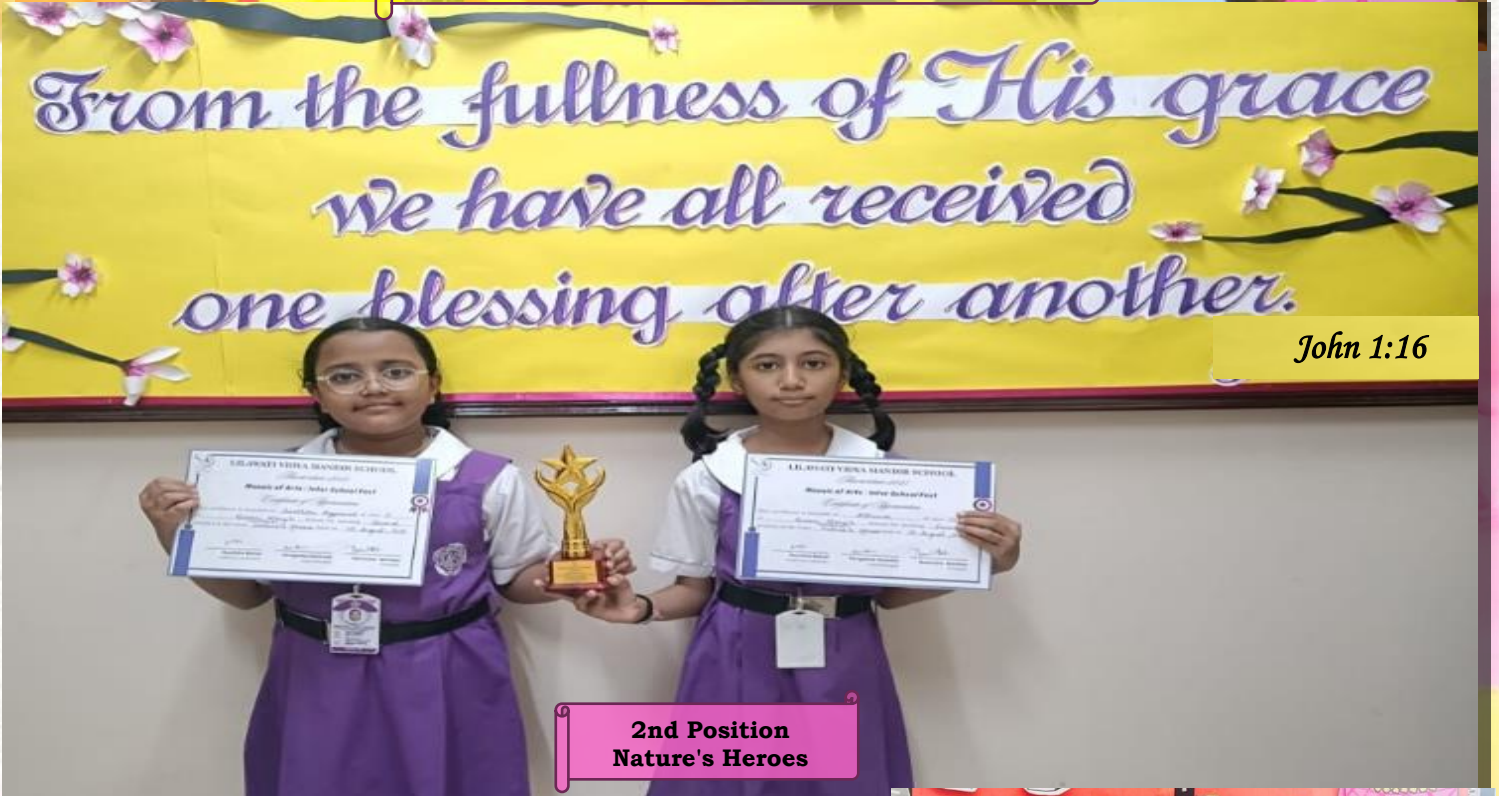
2nd Position Nature's Heroes