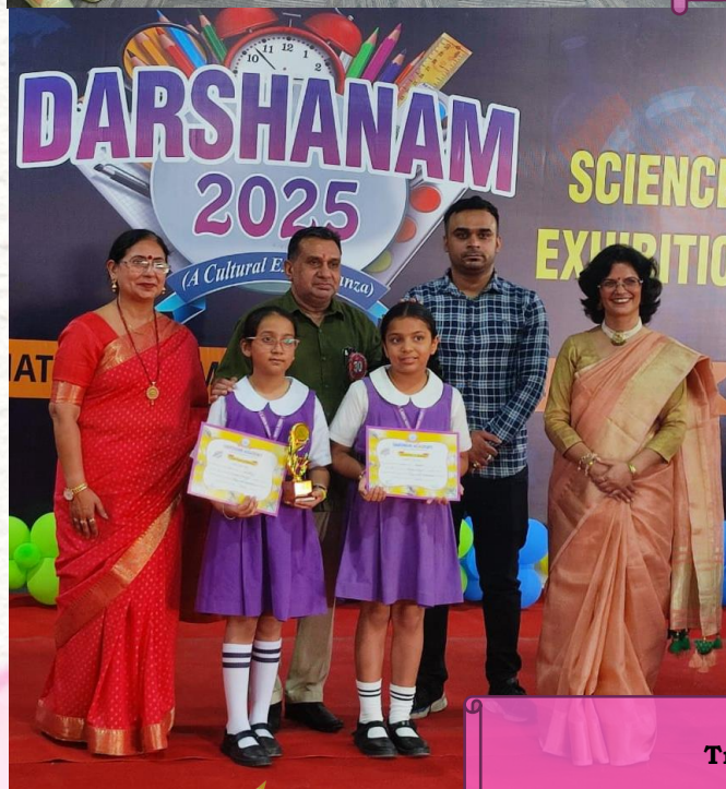
1st Position Trash to Treasure