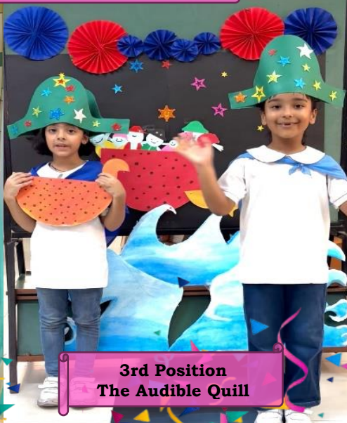
3rd Position The Audible Quill