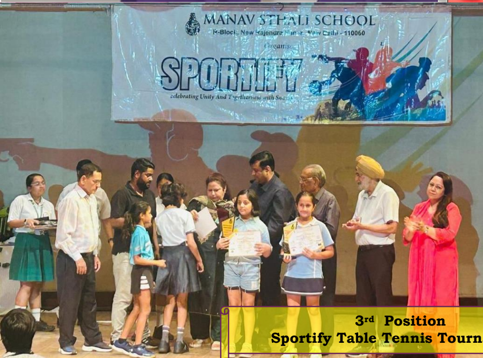
3rd Position Sportify Table Tennis Tournament